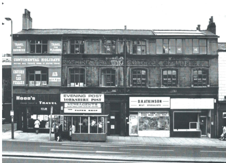
Figure 1: Yorkshire Training College of Music