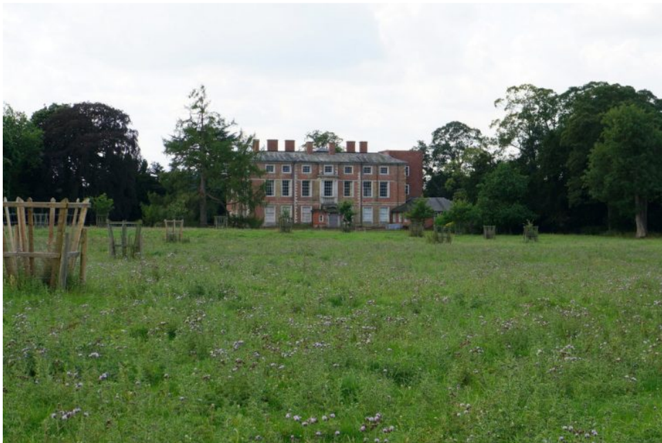
Figure 3: Nun Appleton Hall