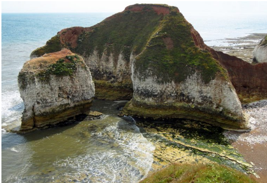
Figure 2: High Stacks, Flamborough Head

Rather like the Derbyshire composer, Roger Sacheverell Coke (1912–72), Baines's output is focused on piano music on account of his isolation and his almost enforced prowess on this instrument. His own, often luxuriantly chromatic, music is audibly influenced by his listening, with the impact of hearing Debussy, Delius and Scriabin, a composer whose Symphony no.2 made Baines's back record '20 degrees below zero!' (14 September 1921), clearly heard. His musical language is also coloured by his isolated circumstances, with an abundance of tone poems inspired by the local places he loved so well. The coast at Flamborough was a particular fascination, with several piano miniatures including the two works that constitute Tides , 'The Lone Wreck' and 'Goodnight to Flamboro', linked to its rocky headland.