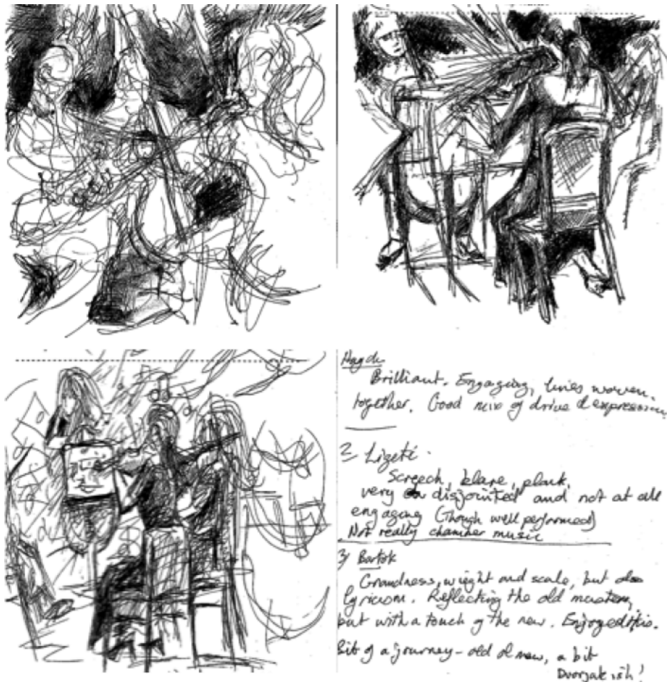
Figure 2: Write-Draw response from a regular audience member

Many of the drawn responses by adult members were far more fluid than the fragmented replies from under 25s. They also relied more heavily on literal representations of the players, rather than abstract or metaphorical drawings. The written side often included musical terms but was also used by regular audience members to give feedback to the arts organisation, for example, the programming choices of the arts organisation, seen through the statement that Ligeti is 'not really chamber music' according to this audience member.