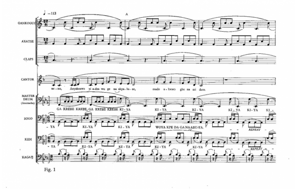
Figure 1: Transcription of Ewe drumming music (Source: A. M. Jones, Studies in African Music (1959), as reproduced in Robert Fraser, West African Poetry: A Critical History (1986))

Here is a transcription of the Ewe Nyayito funeral dance from Jones' Studies in African Music, as reproduced from my own book West African Poetry of 1986.^{10}