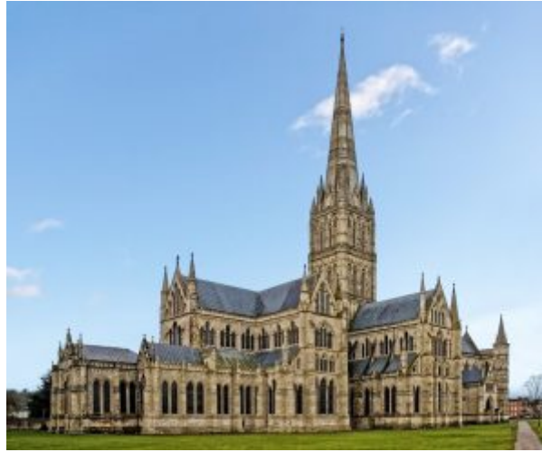
Figure 2: Salisbury Cathedral

Liturgical experiences, like those of a musical nature, tend to be grounded in the listeners' knowledge and preferences. The thread concerning a broadcast from Salisbury Cathedral on All Saints' Day, 1 November 2017, provides two examples.